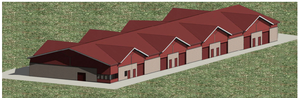
Organizational Storage Building

for the main facilities are: 135,633 SF for the Aircraft Maintenance Hangar, 14,350 SF for the Organizational Storage Bldg, and 11,567 SF for the Company Operations Facility. The utilities to the buildings will be provided by Doyon Utilities.